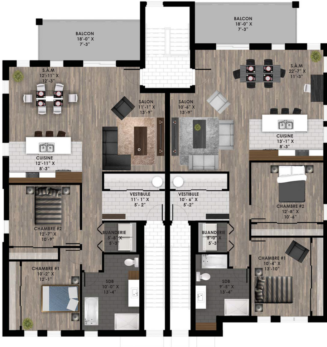
Unité D 2 Chambres Superficie nette: ± 1171 pi 2